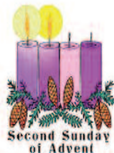
Second Sunday of Advent

This week in Advent we light the second candle and ask for peace. The Lord loves you and wants to bring you peace within this world of chaos. He has so much in store for you and wants nothing more for you to give Him the opportunity to prove His love for you.