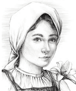
St. Maria Goretti

life, death and the faith of Maria Goretti. In her weakness she became the instrument that the Lord would use to show the transforming power of His love and forgiveness. St. Maria Goretti's feast day is July 6th. She is the patron saint of chastity, rape victims, youth, teenage girls, poverty, purity and forgiveness. She is a beautiful gift for our hurting world today. Saint Maria Goretti, pray for us!